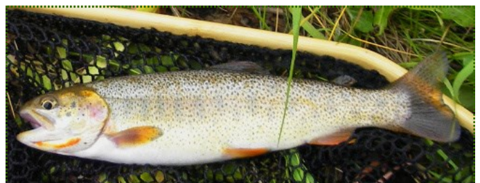
Snakeriver Finespot Cutthroat

(These websites were used as sources for this article.)